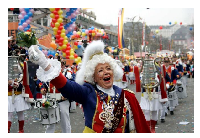
Carnival in Mainz