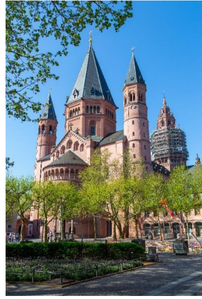
St. Martin's Cathedral