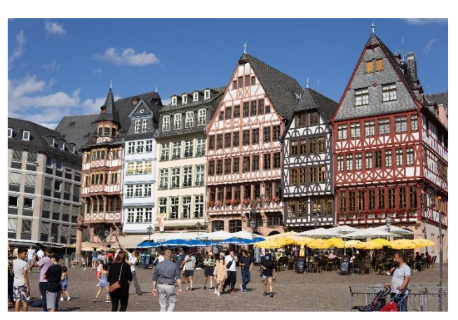
Frankfurt Main historical city centre