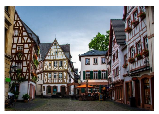
Historical centre Mainz