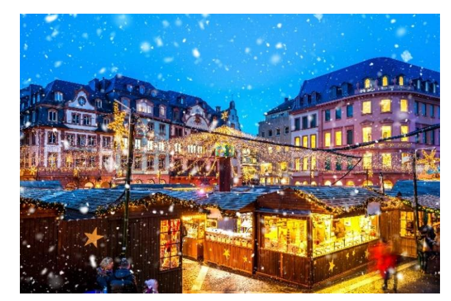
Christmas Fair in Mainz

Further information about living and studying in Germany: