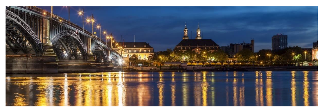
The Rhine by night

Mainz has a high number of students, which is why the city is very dynamic and offers many attractive leisure time activities for young people.