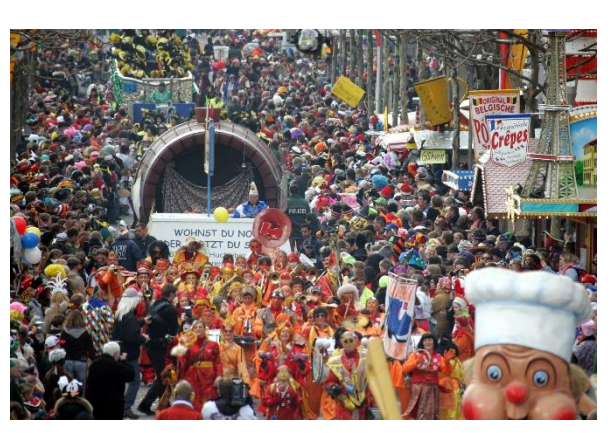
Carnival Monday in Mainz