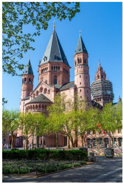
St. Martin's Cathedral