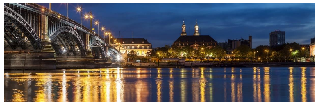
The Rhine by night

Mainz has a high number of students, which is why the city is very dynamic and offers many attractive leisure time activities for young people.