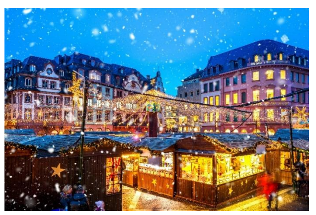
Christmas Fair in Mainz