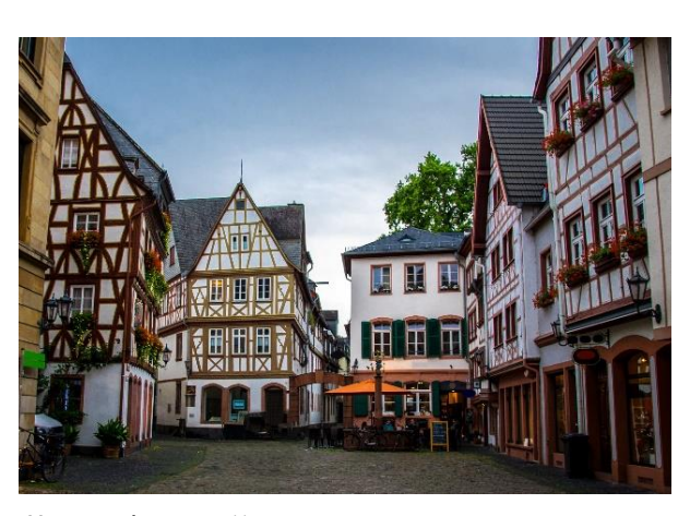
Historical centre Mainz