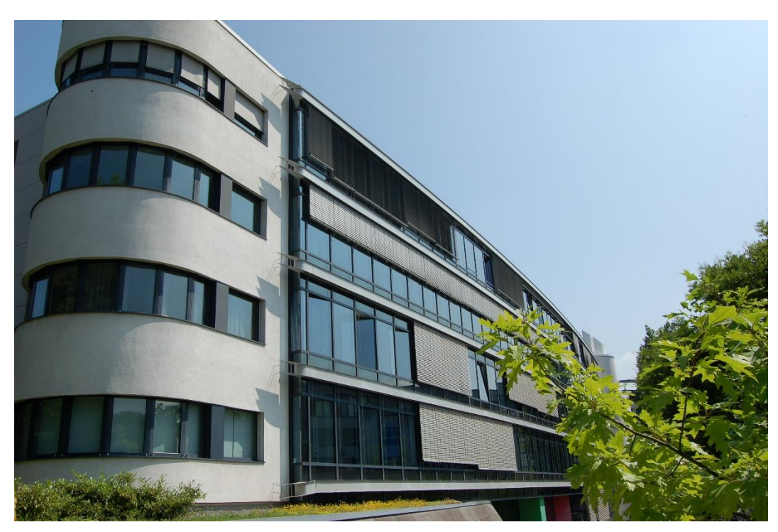
Catholic University of Applied Sciences Mainz