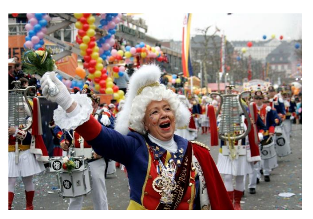
Carnival in Mainz