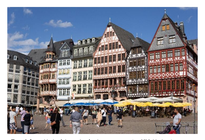
Frankfurt Main historical city centre